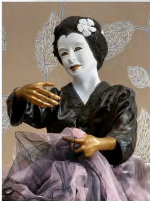
Sayuri, H 1,65 cm, bronze, 2014