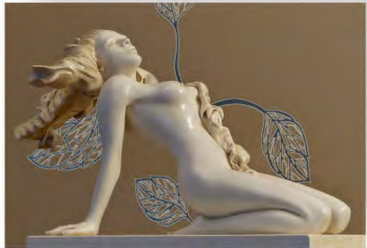
Lobelia, H 45 cm, L 65 cm, marble, resin, 2010