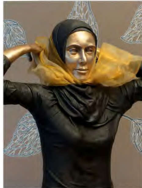
Asmea, H 1,70 cm, bronze, 2015