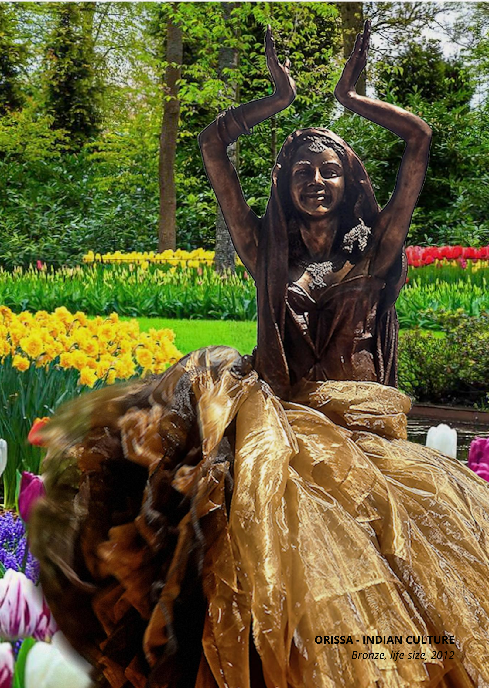
ORISSA - INDIAN CULTURE Bronze, life-size, 2012