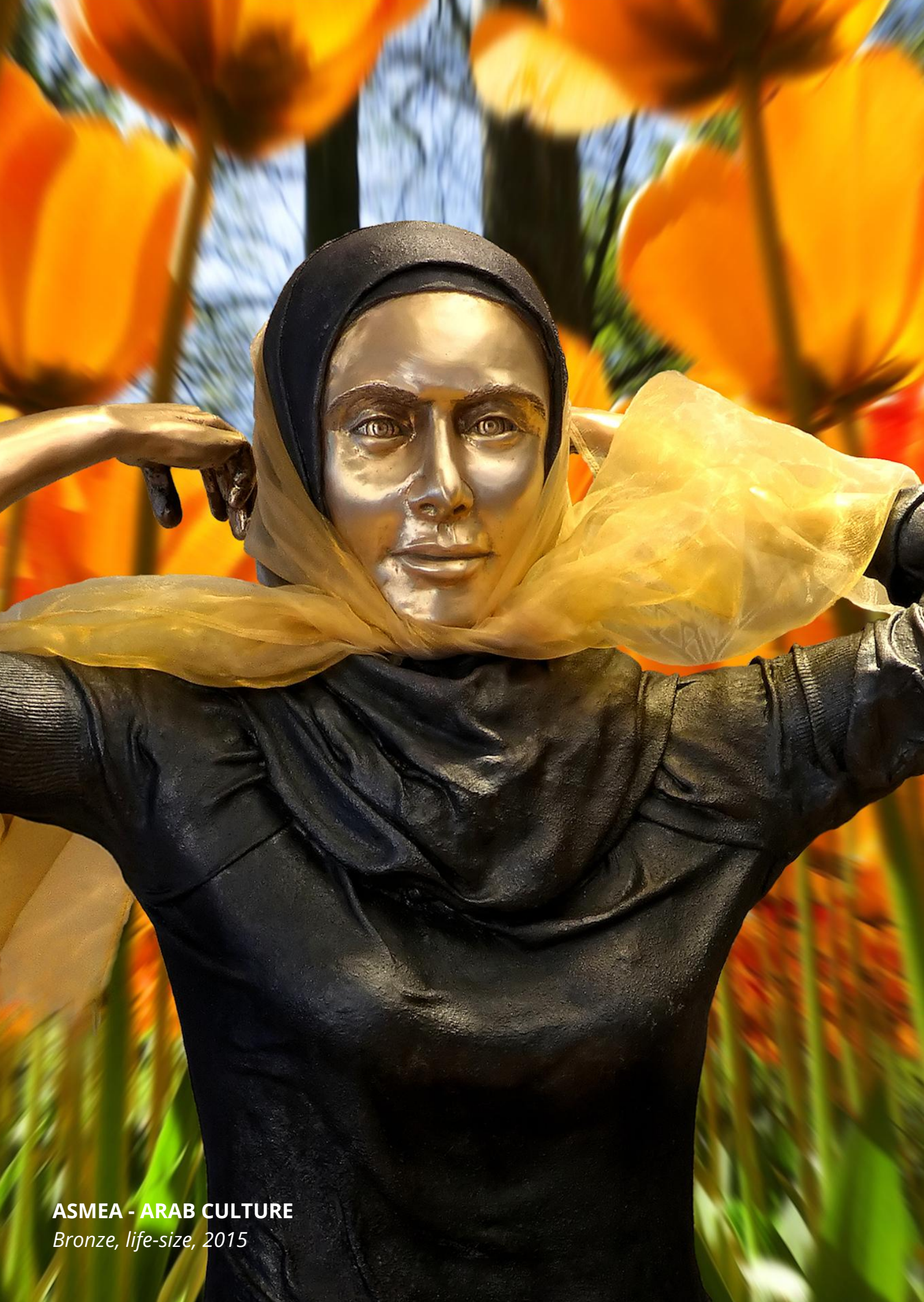
ASMEA - ARAB CULTURE Bronze, life-size, 2015