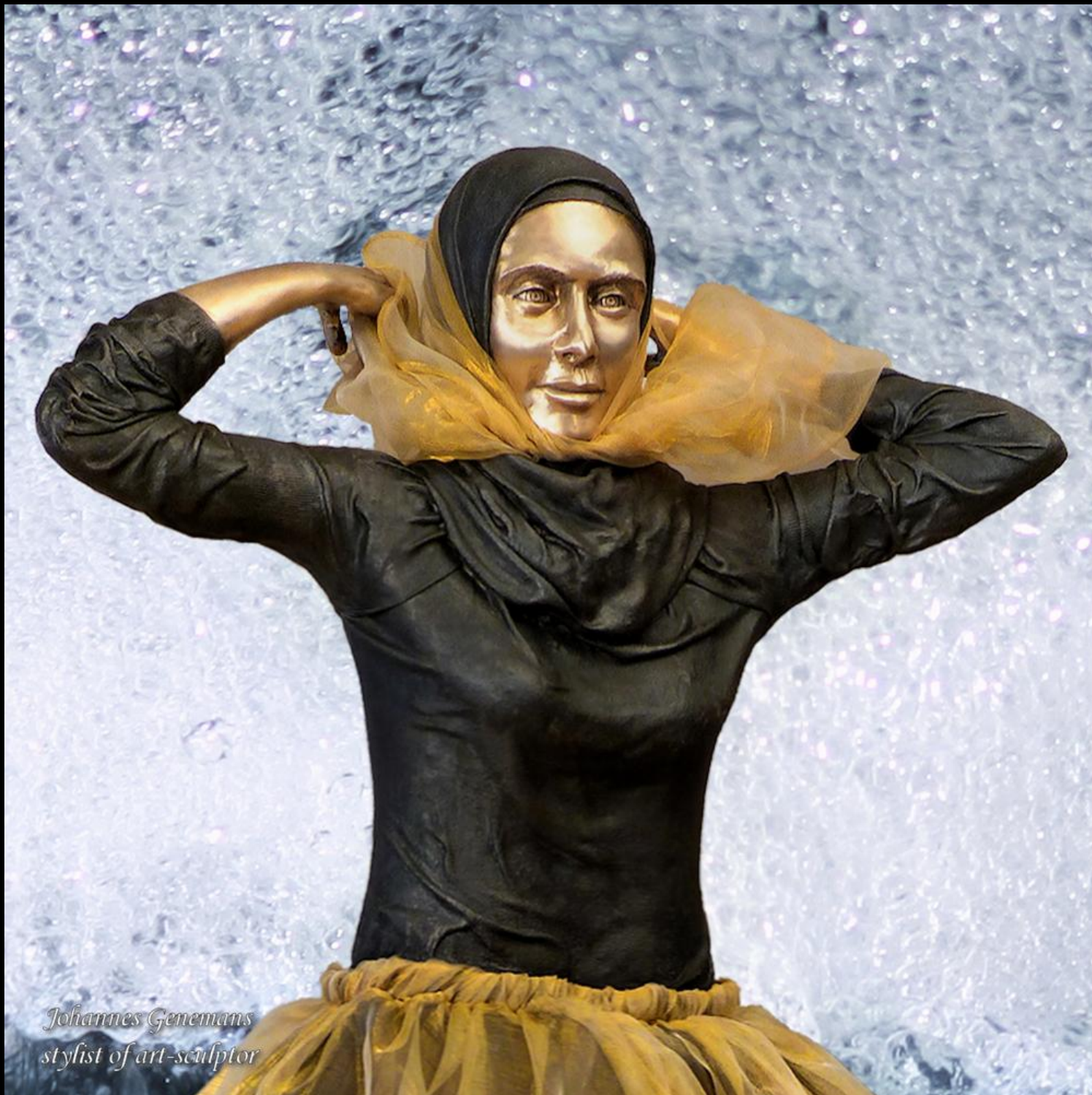
ASMEA - ARAB CULTURE Bronze, life-size, 2015