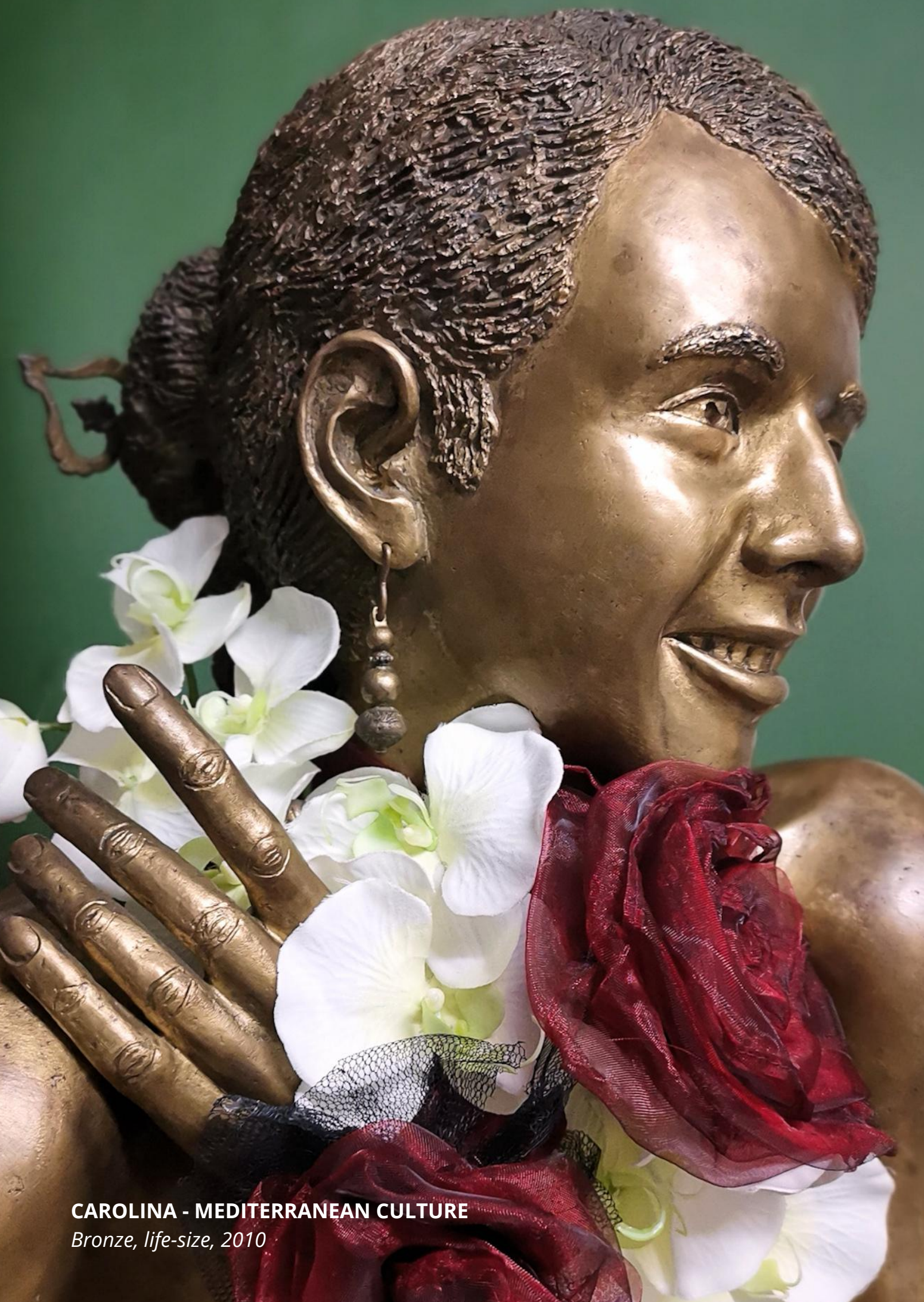
CAROLINA - MEDITERRANEAN CULTURE Bronze, life-size, 2010