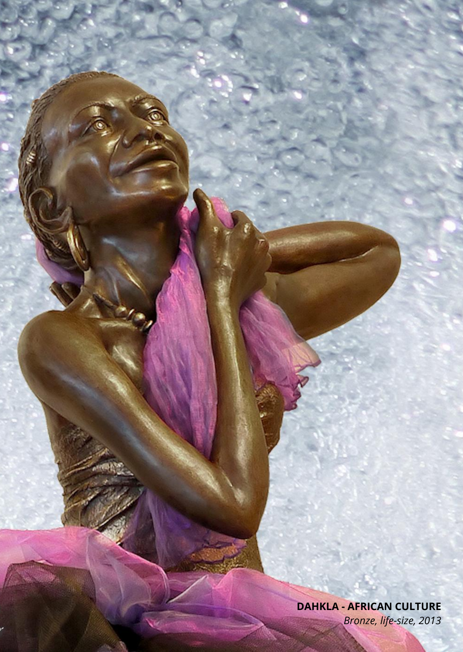
DAHKLA - AFRICAN CULTURE Bronze, life-size, 2013