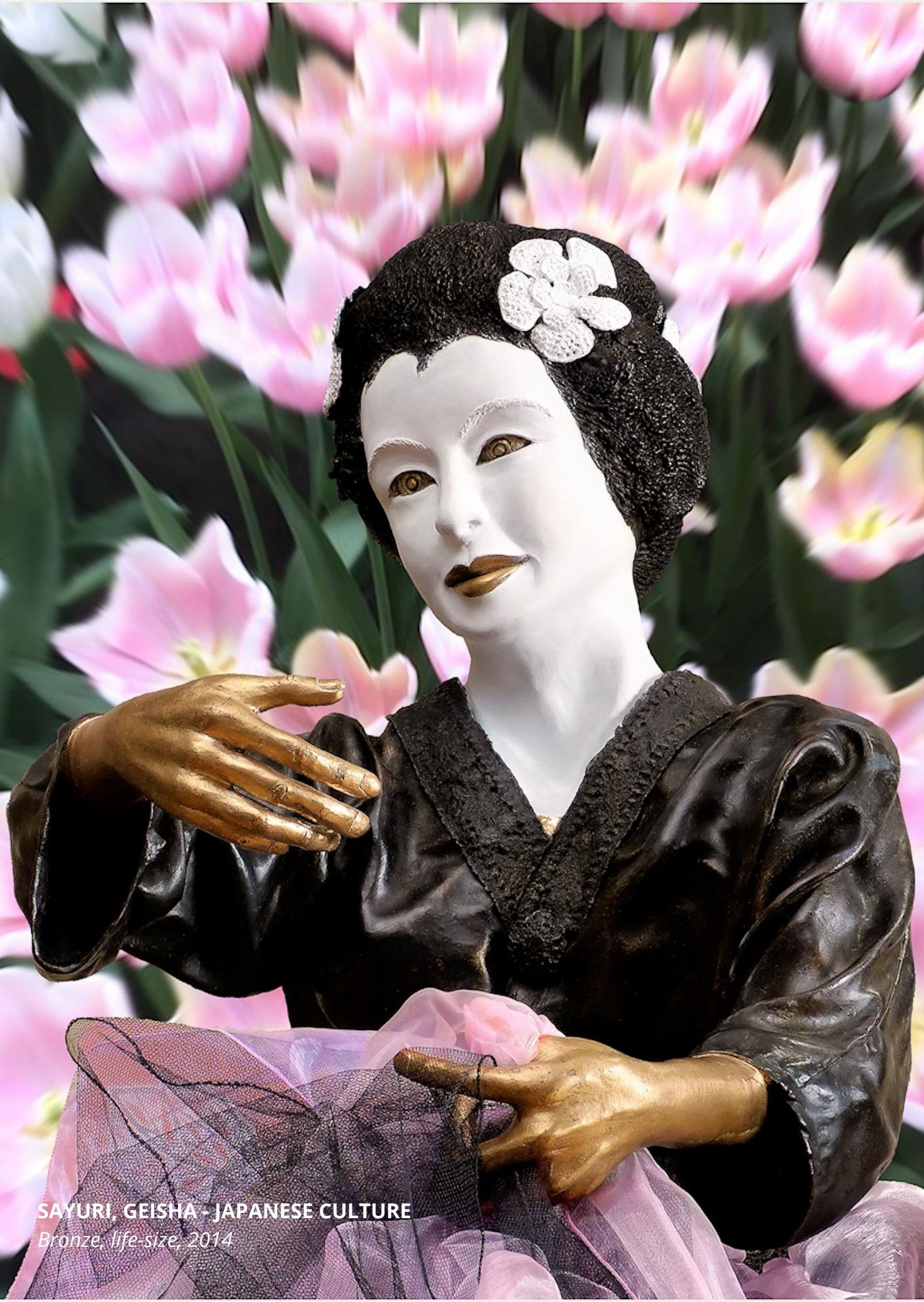
SAYURI, GEISHA - JAPANESE CULTURE Bronze, life-size, 2014