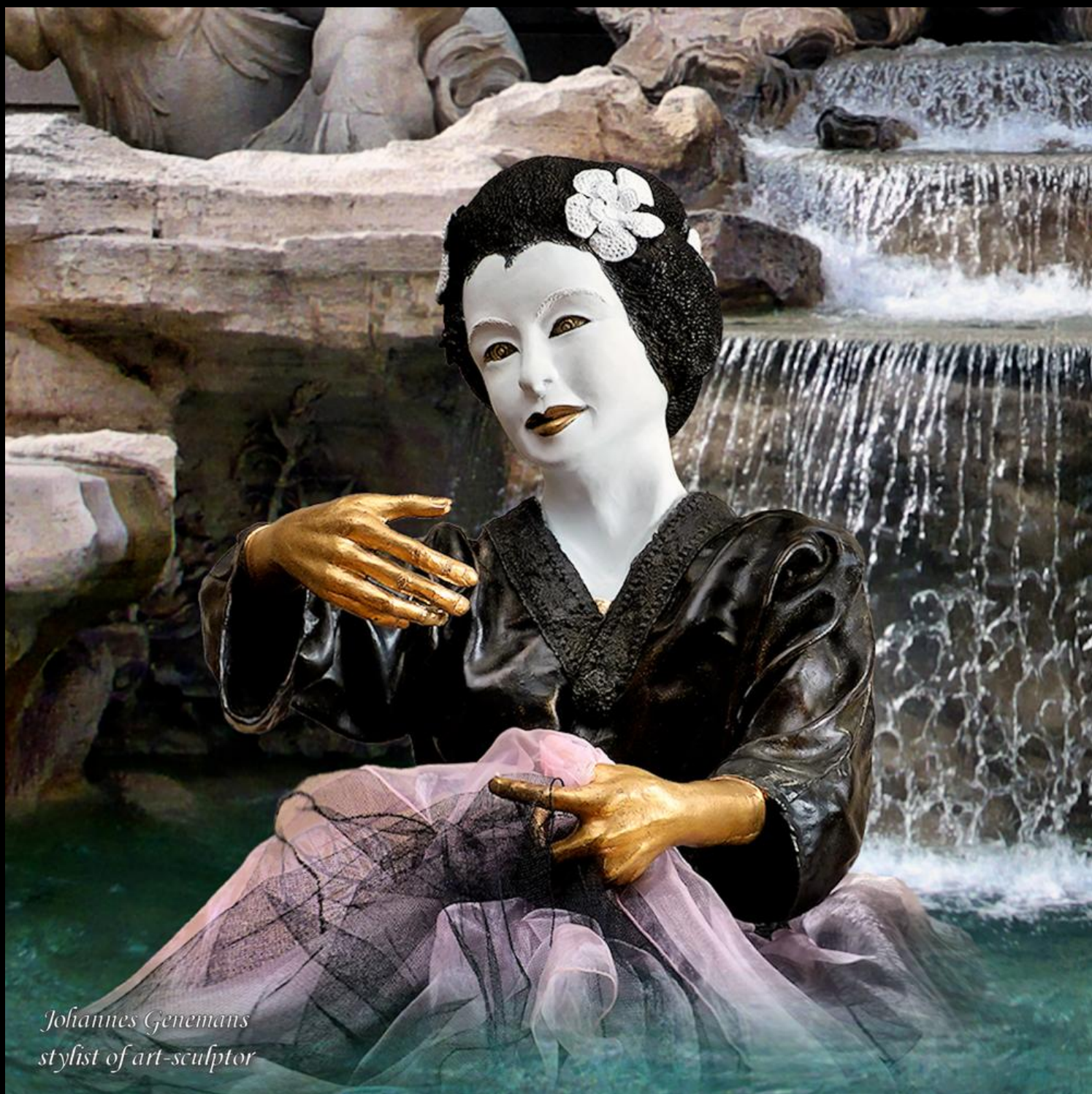
SAYURI, GEISHA - JAPANESE CULTURE Bronze, life-size, 2014