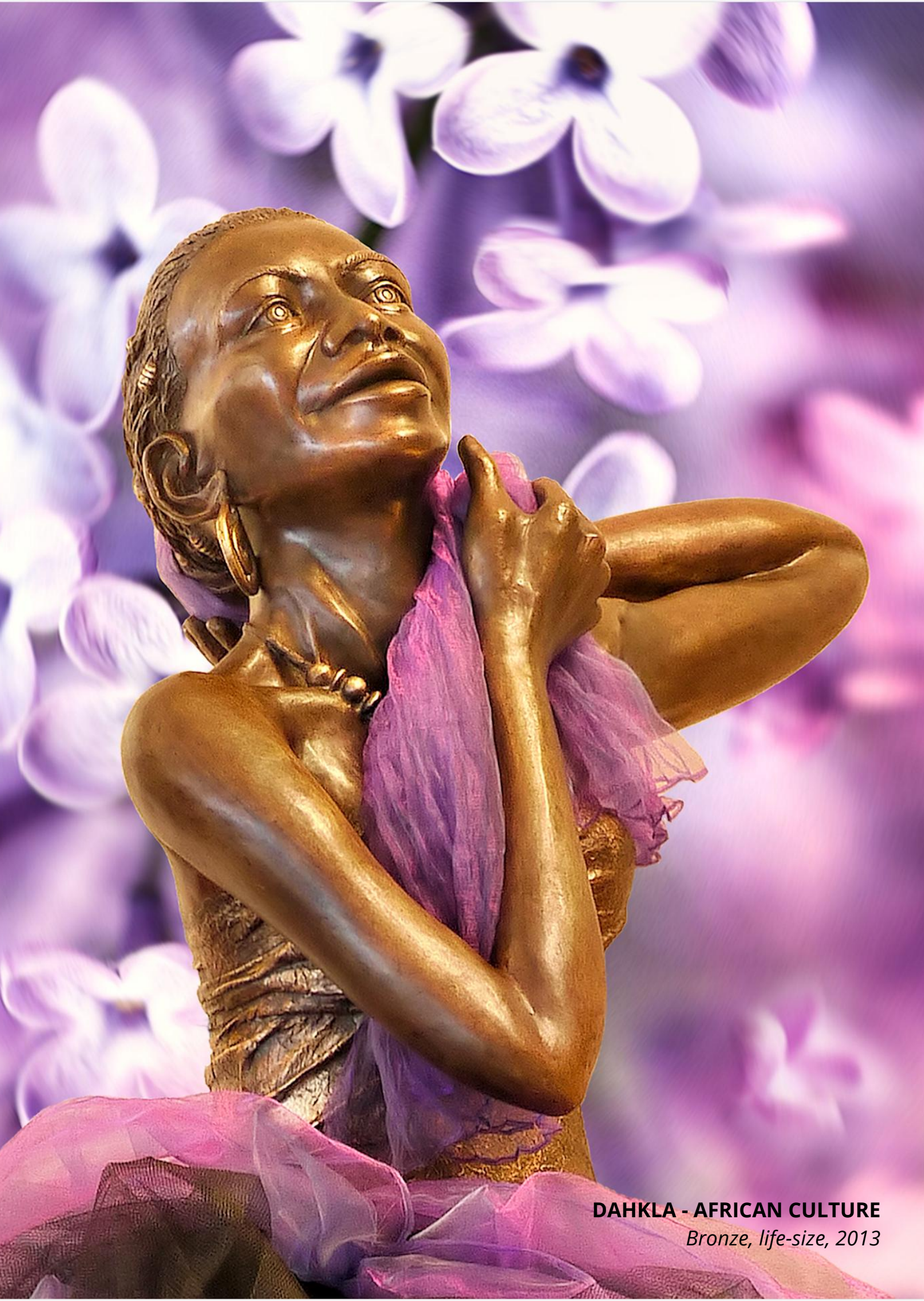
DAHKLA - AFRICAN CULTURE Bronze, life-size, 2013